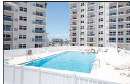
1600 VIA DELUNA DR., #503A, PENSACOLA BEACH, FL $395,000 • MLS# 333530