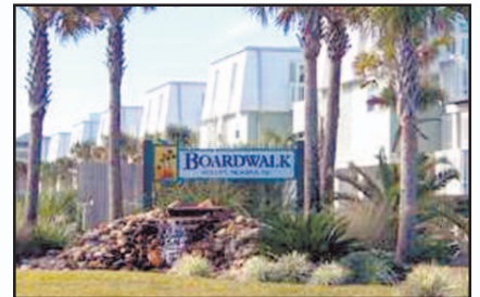
1100 FT. PICKENS RD., #B12, PENSACOLA BEACH, FL $280,000 • MLS# 342793