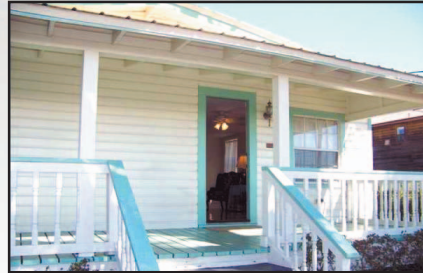
1308 E. BELMONT ST., PENSACOLA, FL $163,000 • MLS# 345206