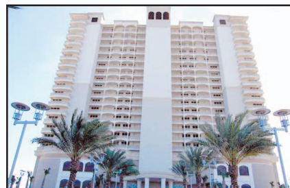
18 VIA DE LUNA DR. #1506, PENSACOLA BEACH, FL $1,200,000 • MLS# 347097