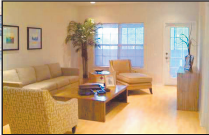
5880 SPANISH TRAIL, #H, PENSACOLA, FL $178,900 • MLS# 348931