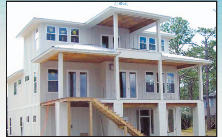
14284 GORHAM RD., PENSACOLA, FL $895,000 • MLS# 346452