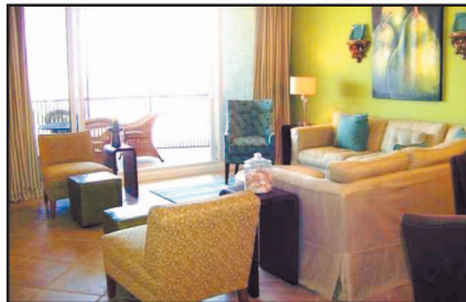
612 LOST KEY DR., #1002B, PERDIDO KEY, FL $699,900 • MLS# 346246