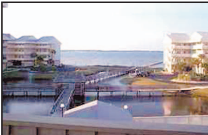
1150 FT. PICKENS RD., #G2, PENSACOLA BEACH, FL $335,000 • MLS# 345783