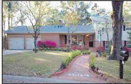
1757 FOX RD., PENSACOLA, FL $390,000 • MLS# 347484