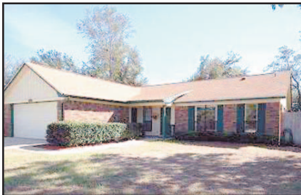
2709 SANIBEL PL., GULF BREEZE, FL $199,000 • MLS# 345015