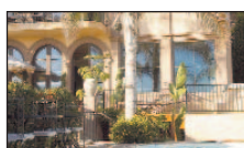
Local Homes For Sale In Your Area! Back Page