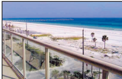
330 FT. PICKENS RD., #7E, PENSACOLA BEACH, FL $590,000 • MLS# 338557