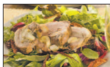
Lovely Lamb Wolfgang Puck Page 7