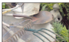
Tool Tips Home and Garden Page 5