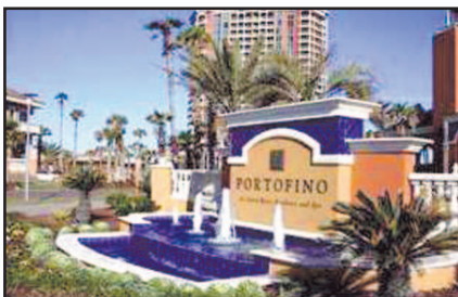
FOUR PORTOFINO DR. #1209, PENSACOLA BEACH, FL $685,000 • MLS# 342942