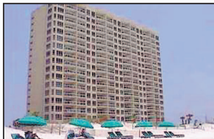
22 VIA DE LUNA DR. #308, PENSACOLA BEACH, FL $875,000 • MLS# 340920