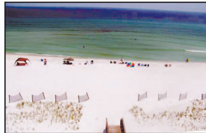
999 FT. PICKENS RD., #407, PENSACOLA BEACH, FL $249,900 • MLS# 334521