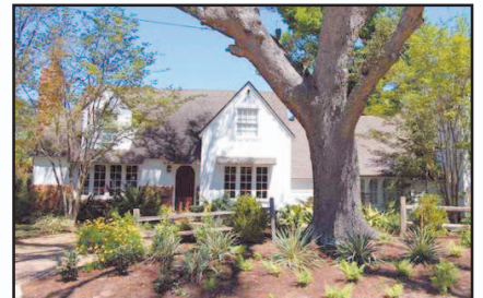
1180 N. 19TH AVE., PENSACOLA, FL $1,250,000 • MLS# 348790